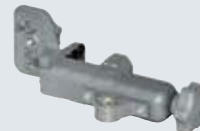
HL700, HL750/U and HL760/U includes C70 Adapter for receiver with Bubble Vial PN C70