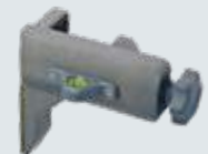
C50 Adapter included with CR600 receiver