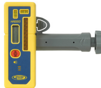
HR1220 receiver and C45 rod clamp optional