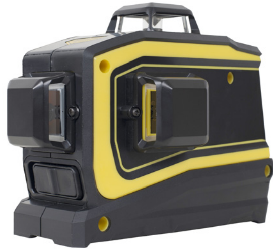
LT56-2 features a strong metal sunshade