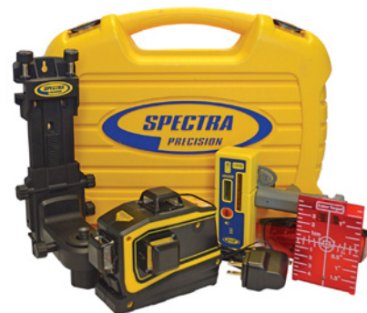
LT56-2 package with HR1220 receiver